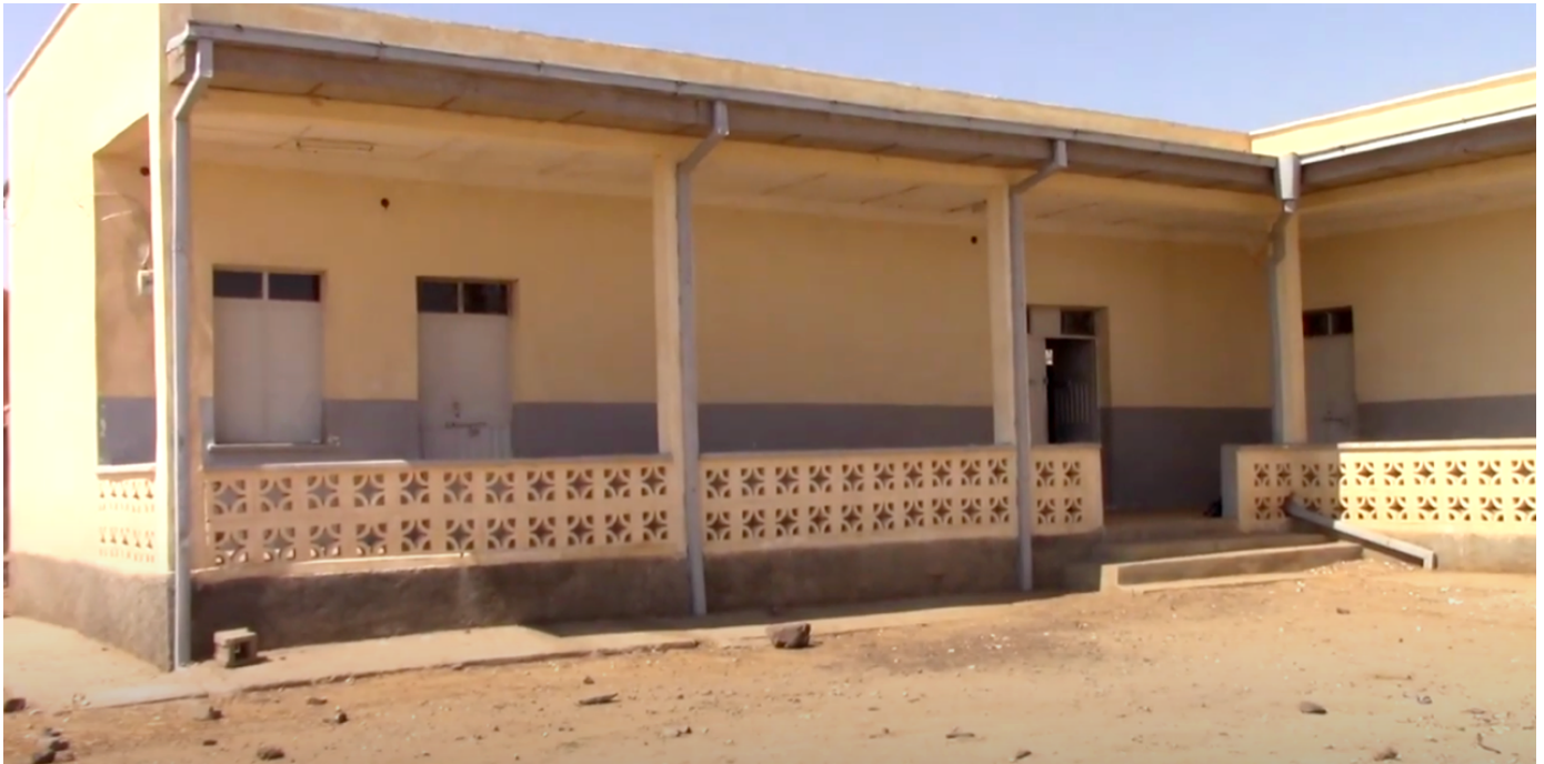
Kerkebet Maternity Home. A project constructed in coordination with the Eritrean Development Foundation.